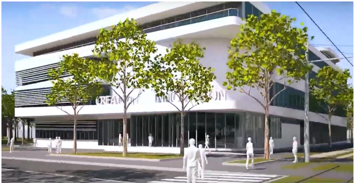
Maison de la Création et de l'Innovation MaCI